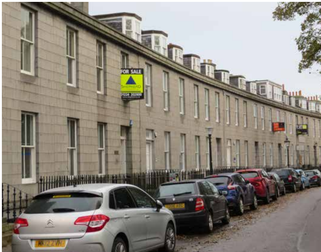
Bon Accord Crescent properties on the open market

This document provides parameters for development along established lanes within the City Centre , part of the Albyn Place / Rubislaw conservation area , and for new development along lanes in masterplanned areas . This document provides policy for the creation of residential mews buildings in these areas, although the forms of development advocated may also be appropriate for a range of other uses, if demonstrated as being in accordance with the Aberdeen Local Development Plan.