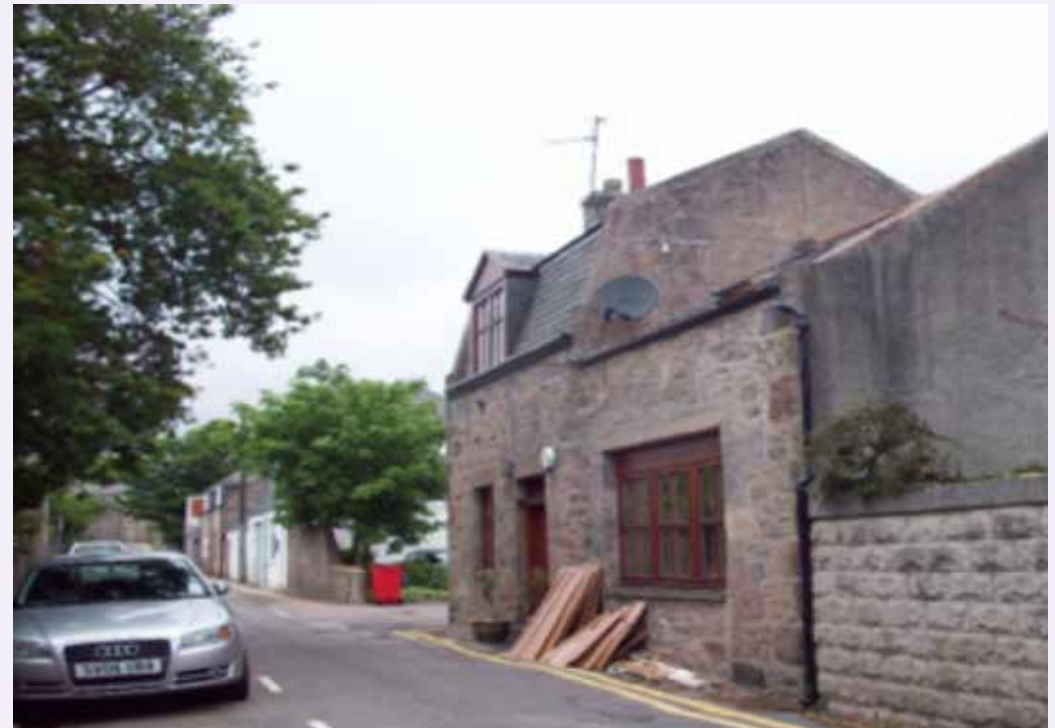
Mews buildings in Aberdeen

2.5.3 Masterplan Zones – Sites within the Aberdeen Local Development Plan’s Masterplan Zones should consider in-curtilage car parking in the form of garaging integral to a mews development and with the garaging serving no more than the residence above in order that residential amenity is not compromised. The provision of garaging that serves nearby property will require robust justification.