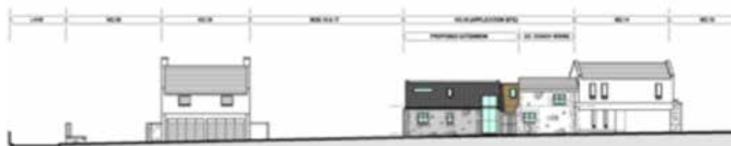
Examples of new mews building as part of the comprehensive redevelopment of 15 Bon Accord Crescent (Courtesy of Neil Rothnie Architects)

1.4.2 Within the feu of historic residential properties with a change of use to offices often allowed the on-site accommodation of car parking resulting in the loss of the rear walls of the feu and any buildings to the lane as well as significantly intensifying vehicular traffic movement along the lane.