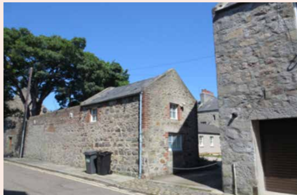
Mews buildings in Aberdeen