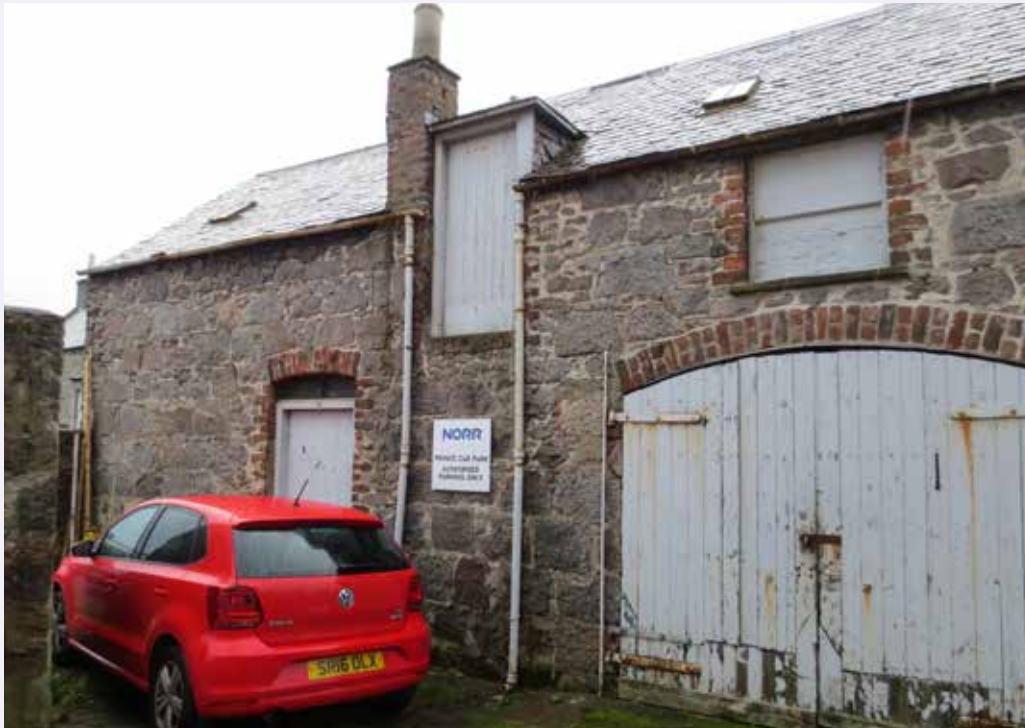
Historic mews on Bon Accord Crescent Lane