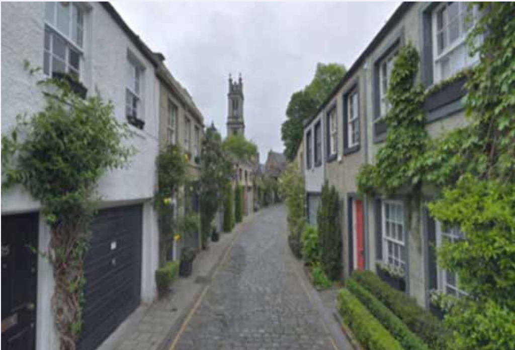
Historic mews in Stockbridge Edinburgh converted into attractive dwellings