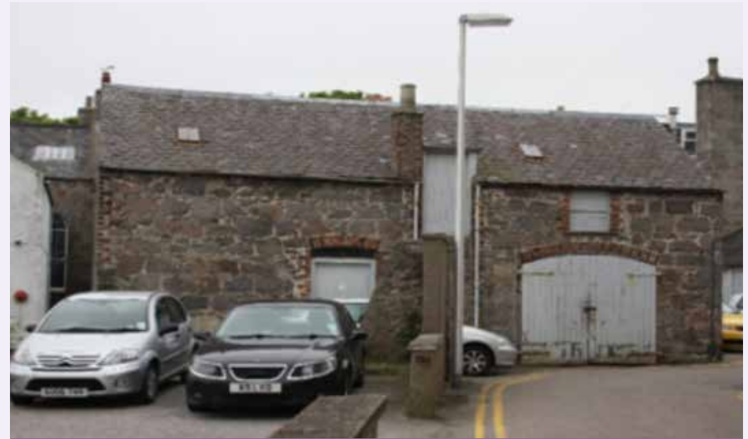
Mews buildings in Aberdeen