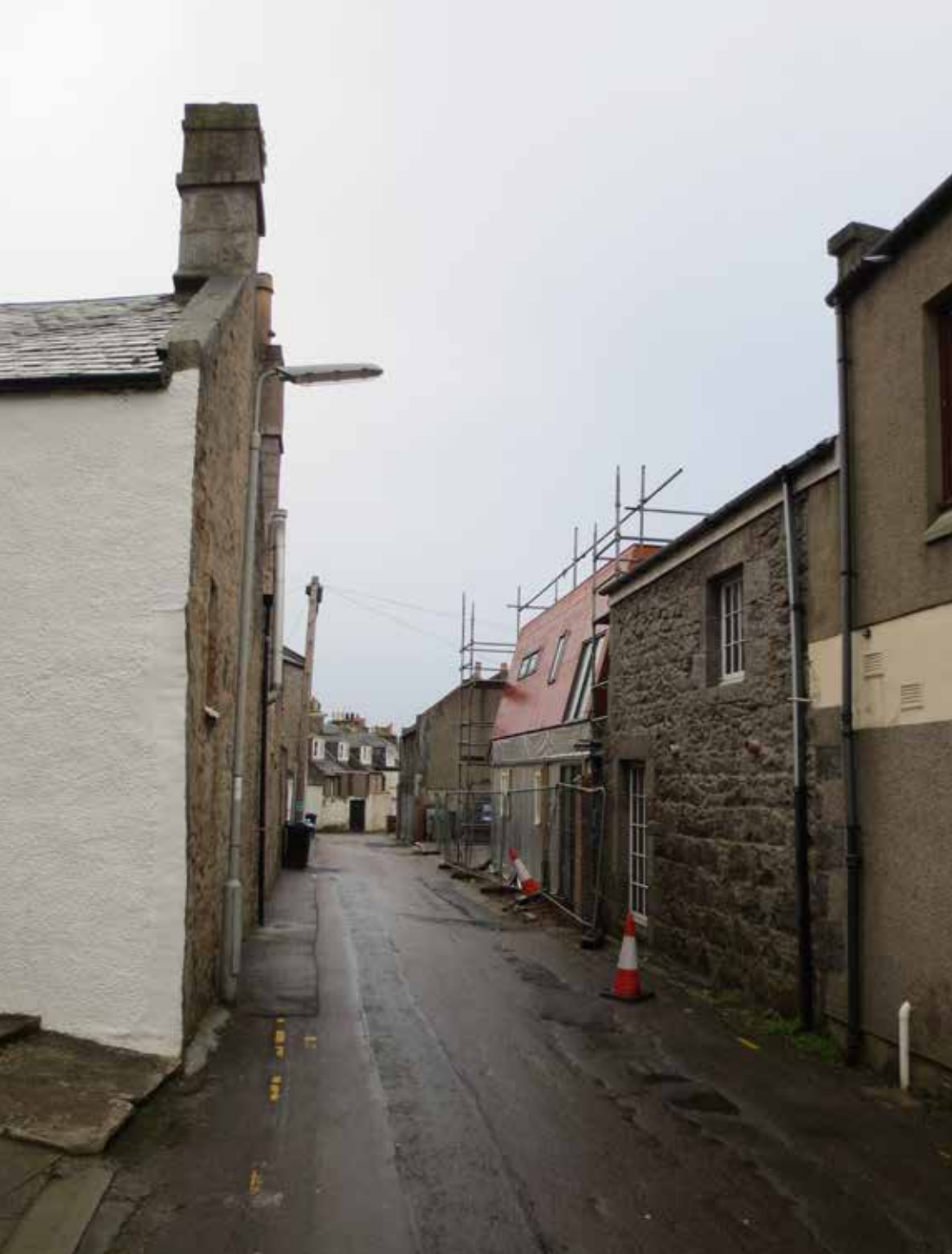
Bon Accord Lane – new mews building under construction