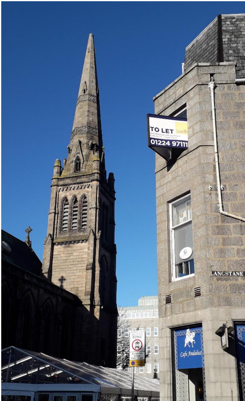
To Let Sign 5 Bon Accord Street