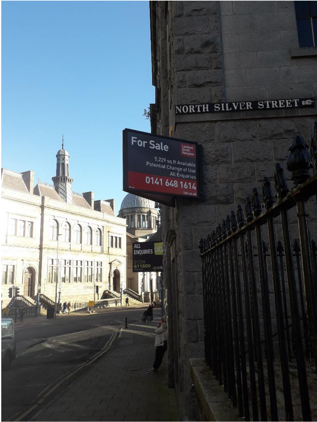
To Let Sign Skene Street