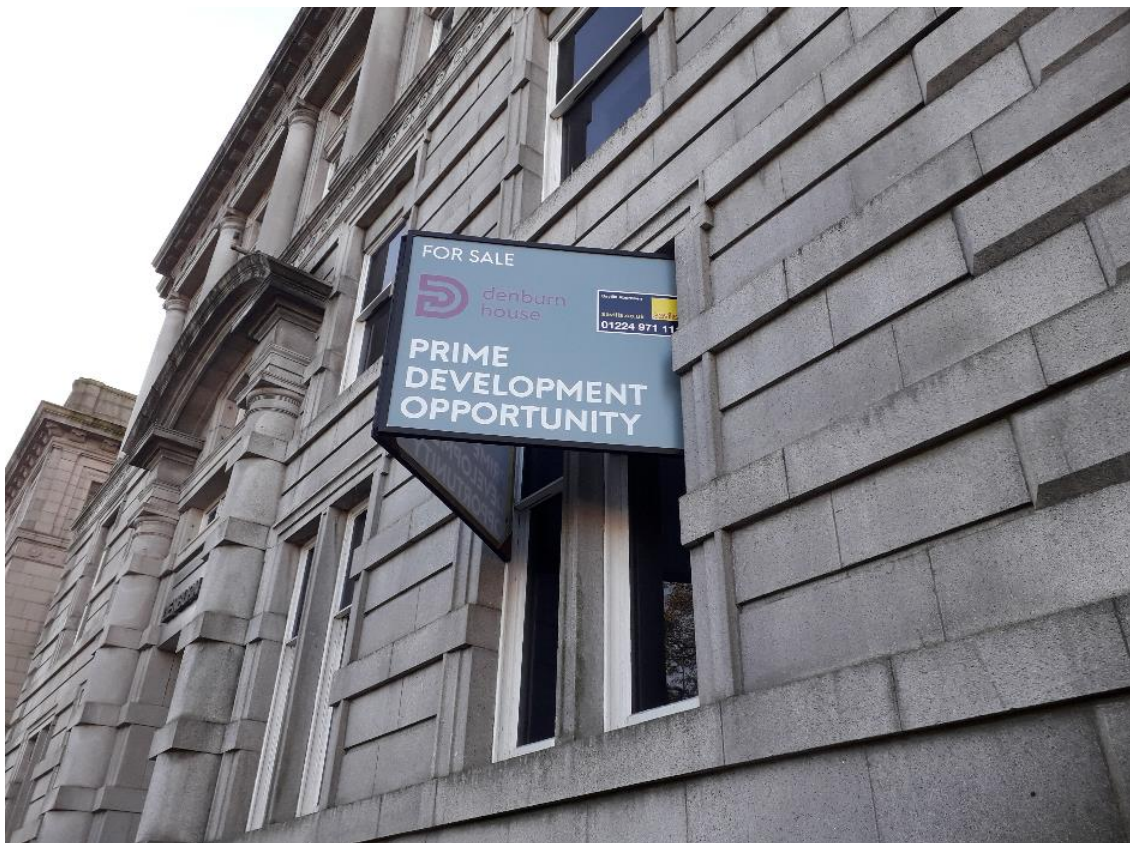
Denburn House To Let Sign